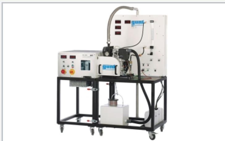
Complete experimental setup with HM 365, CT 159 and CT 151